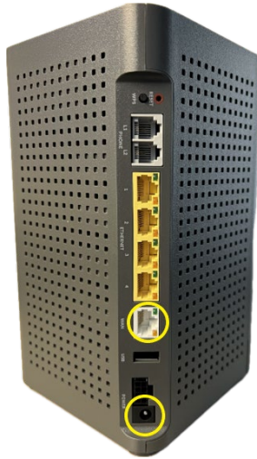
MTCO GigaSpire u6

Connect your MTCO GigaSpire u6 Router to a power outlet. *Estimated Power-up Time.